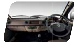
DUAL TONE INTERIORS