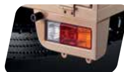
TAIL LAMP PROTECTOR