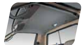
MOULDED ROOF WITH INTEGRATED ROOF LAMP